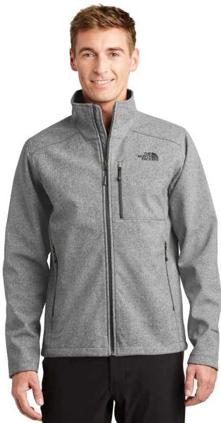
TNF MEDIUM GREY HEATHER