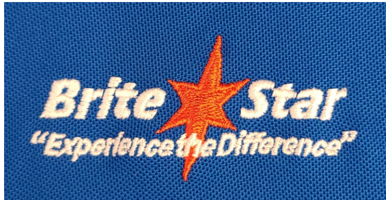
Direct Embroidered Company Logo Your company logo is sewn directly onto the garment.