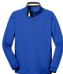
GAME ROYAL / BLACK / WHITE