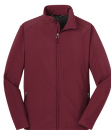
Maroon (Men's Only)