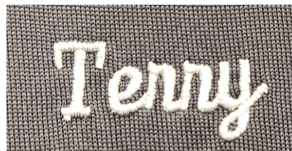
Script Font Direct Embroidered Name

NAME EMBROIDERY COLORS WILL BE COMPLIMENTARY TO COMPANY LOGO COLORS