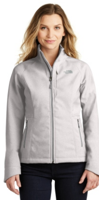
TNF LIGHT GREY HEATHER