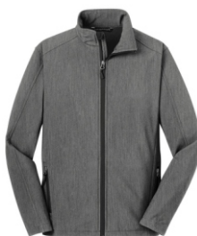
Pearl Grey Heather