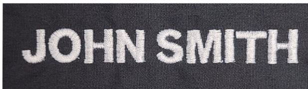
Block Font Direct Embroidered Name