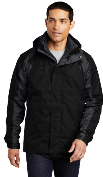
Black / Ink Grey