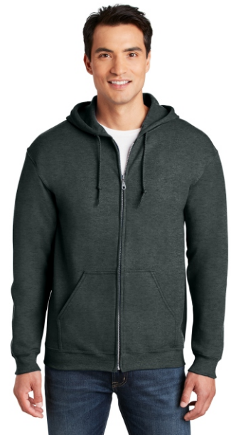
Dark Heather Grey