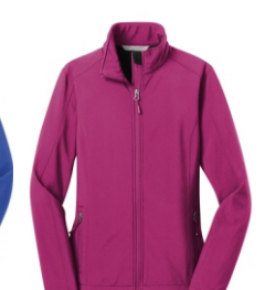
Very Berry (Ladies only)