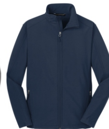
Dress Navy Blue