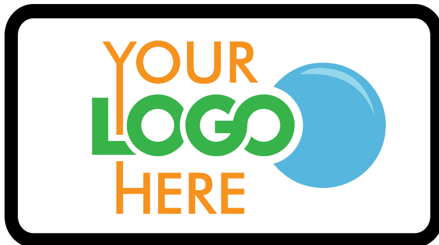
Company Patch - Actual Size