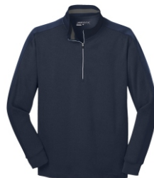
MIDNIGHT NAVY HEATHER / MIDNIGHT NAVY