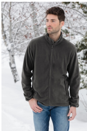
Microfleece Zip In Liner