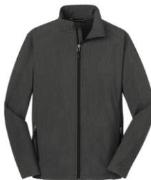
Black Charcoal Heather