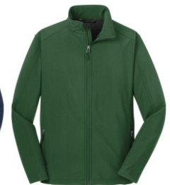
Forest Green (Men's only)