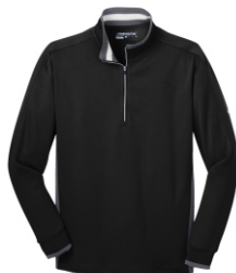
BLACK / DARK GREY / WHITE