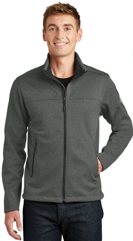
TNF DARK GREY HEATHER