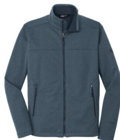
URBAN NAVY HEATHER