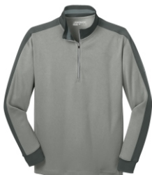
ATHLETIC GREY HEATHER / DARK GREY