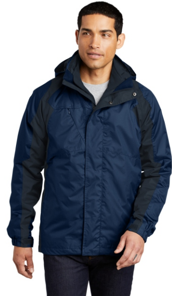
Insignia Blue/ Navy Eclipse