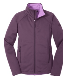
TNF BLACKBERRY WINE