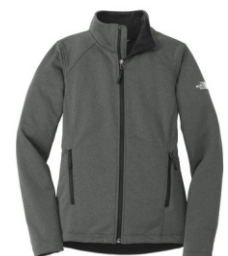
TNF DARK GREY HEATHER