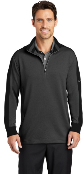
ANTHRACITE HEATHER / BLACK